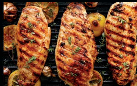
Authentic char-grill marks

High heat gives you the sear and grill marks you crave without overcooking. No hot spots. No cold spots. Just even cooking from edge to edge for juicy, sizzling dishes every time.