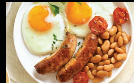
Even edge-to-edge heating