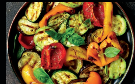
High-heat cooking up to 260°C