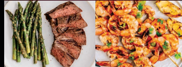
Sirloin steak & asparagus

Best for cooking thick cuts of meat or frozen protein.