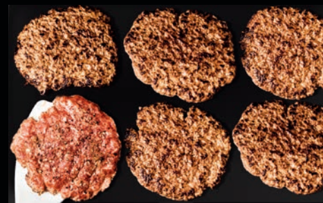
Large cooking capacity for family-sized meals